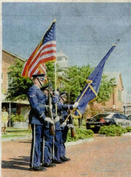
Guards stand during a flag salute at the event.

Local yacht clubs, captains cruise vets around Pensacola Bay