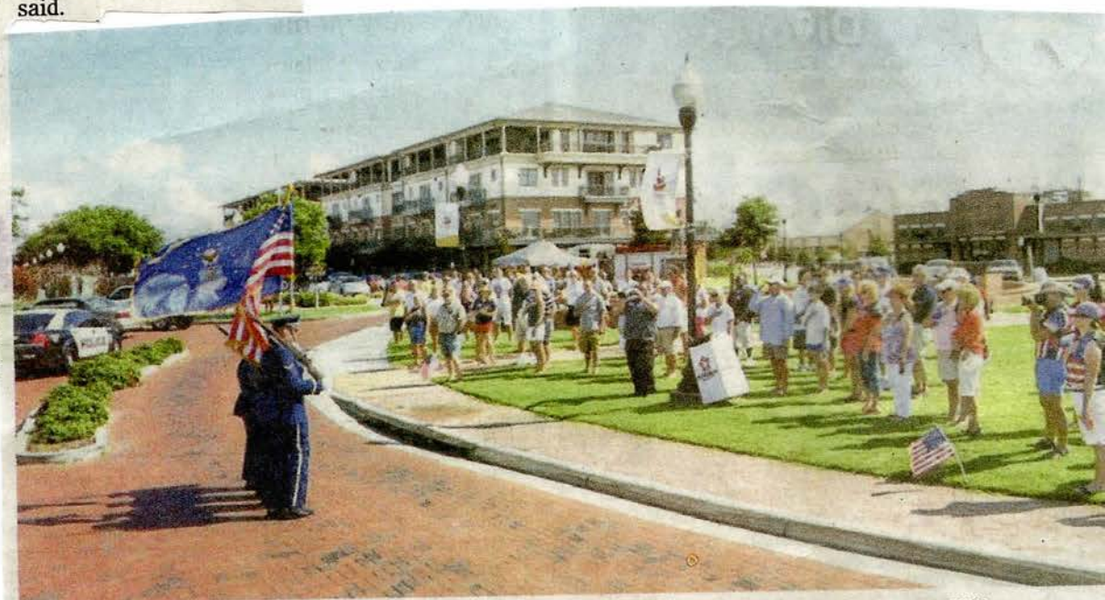
Hundreds of people turned out for the event for wounded American veterans.

"For them to come home and see that America hasn't forgotten about them means a lot," she said.