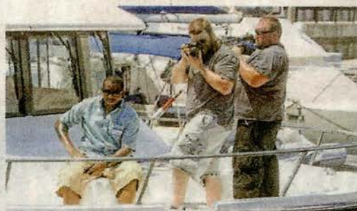
Two dozen boat captains took veterans for boat rides Saturday.