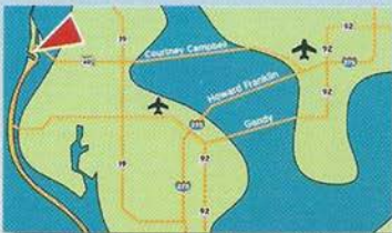
Chart House Suites 850 Bayway Boulevard Clearwater Beach, FL 33767 727-449-8007 www.ChartHouseSuites.com

26 slip Marina Adjacent to Clearwater Yacht Club